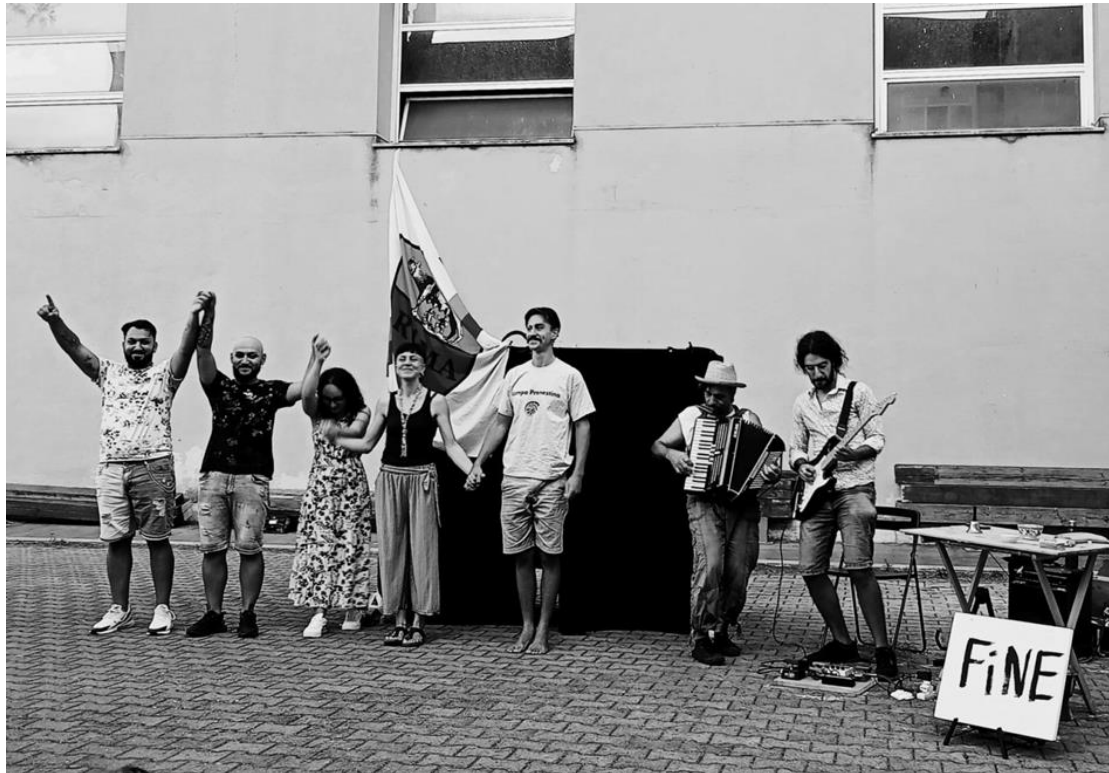
The premiere at Asinitas Cultural Venue

The audience responded warmly, repeatedly interrupting with applause and bursting onto the scene to dance along to the closing music of the show. Many children were also present in the front row of the audience and we were able to see that the text, due to its lightness, irony and comedy with which the dramatic themes and social protests are treated, is suitable for audiences of all ages, which it is in line with our intention to bring the show to schools too, starting from lower secondary schools.