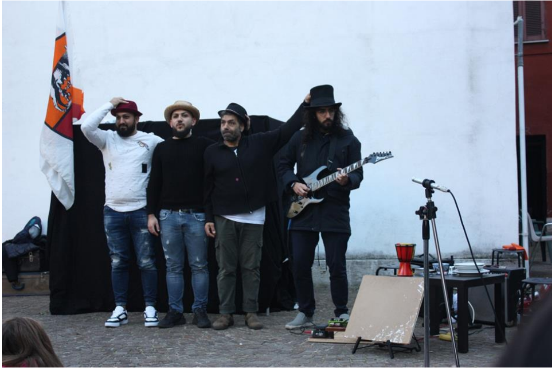
"Waiting for Bo" at Casale Garibaldi

From my long experience in the theatre, I know that a show, in order to refine, evolve and perfect itself, must necessarily be performed in public as much as possible. For this, despite having completed the project schedule with the two shows performed, together the company decided to offer the show to the cultural and social structures of the city. But a surprise awaited us!