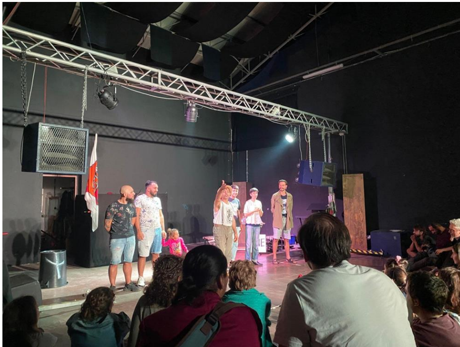
"Waiting for Bo" at SCUP

The project schedule provide two representations of the play, to reach a certain number of spectators, and we had included the second show in the programming of a festival organized by the alternative cultural space SCUP (Sport and Popular Culture). We arranged for the event to coincide with the presence of the project partners in Rome for the expected international meeting on the 14th October 2022. For the occasion, Claudia helped us build a themed evening, inviting a street band that performs traditional Roma music, the Balkan Orchestra that closed the evening with a magnificent dance concert.