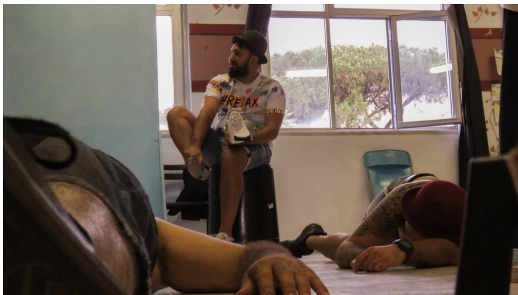
Rehearsals of the show "Waiting for Bo"

There were moments of tension among the younger members of the group which, however, once they were overcome, helped to strengthen the sense of belonging and teamwork. Emotionally strong moments were also experienced during group discussions on the topics covered by the dramaturgy, in search of the right imagery to convey to the public, how to tell dramatic situations actually experienced with humor and lightness.